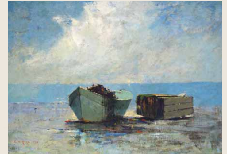
Edward Page: Coastal scene, abandoned dory (1925). Oil on canvas, 22 x 30 inches. At the Swampscott Public Library.