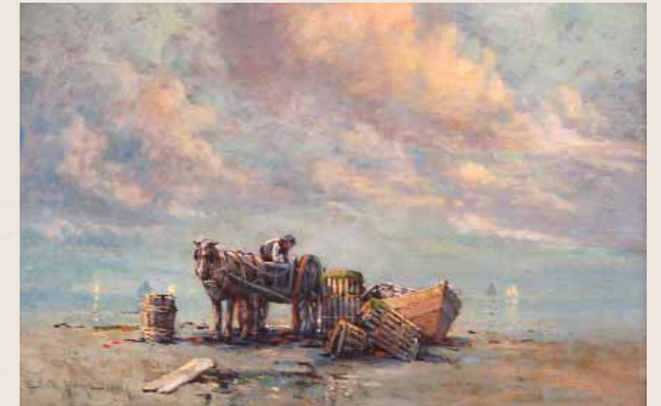
Edward Page, Coastal scene, hauling in the lobster traps (1927). Oil on canvas, 20 x 31 inches. At the Swampscott Public Library