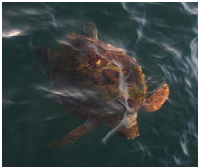
Loggerhead turtle ( Caretta caretta) Linnaeus, 1758.

My thanks to the Blue Ocean Society and the M/V Granite State for their help with article and some great days on the water.