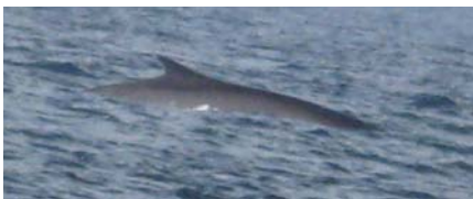
A fast moving finback whale.

Dear Friends , if you haven't treated yourself to a whale watch yet, what are you waiting for? Excursions leave from Boston, Gloucester, and Newburyport from April through October. Your journey will take you to Stellwagen Bank, a prime whale watching spot about 15 miles off our coast. On our family trip this past August, we were treated to the breathtaking and majestic sights of minke, humpback, and finback whales as well as frolicking Atlantic white-sided dolphins, and a host of seldom seen seabirds including petrels, shearwaters, and gannets. Pack a lunch and bring binoculars, camera, sunscreen and warm clothes. Then climb aboard and be prepared for "Discovery Channel" moments right here in our backyard!