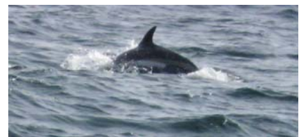
A speedy Atlantic white-sided dolphin.