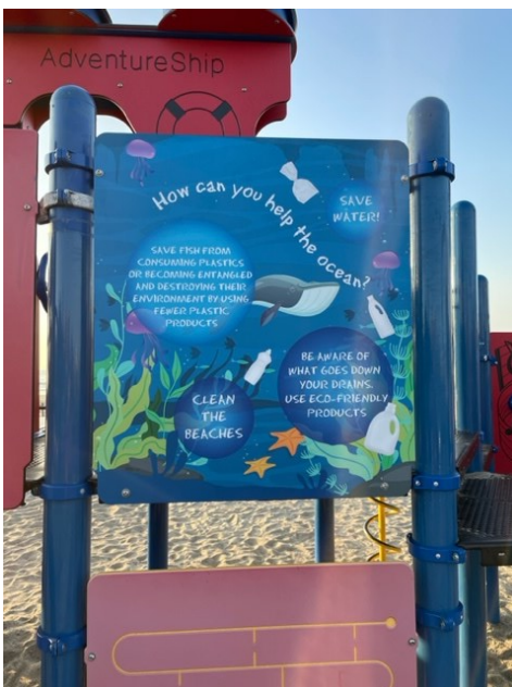
Tot Lot Photos

The Friends appreciate the work of the local DCR staff and the continued improvements by DCR to Lynn Shore and Nahant Beach Reservations.